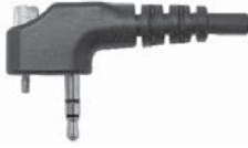
3.5mm Right Angle Connector with 1 Locking Screw

SP200 / SP200K / SP210 Legacy Series-PL1145 / PL2245 / PL2215P / PL2245P / PL2415 PL2445 / PL5161 / PL5164